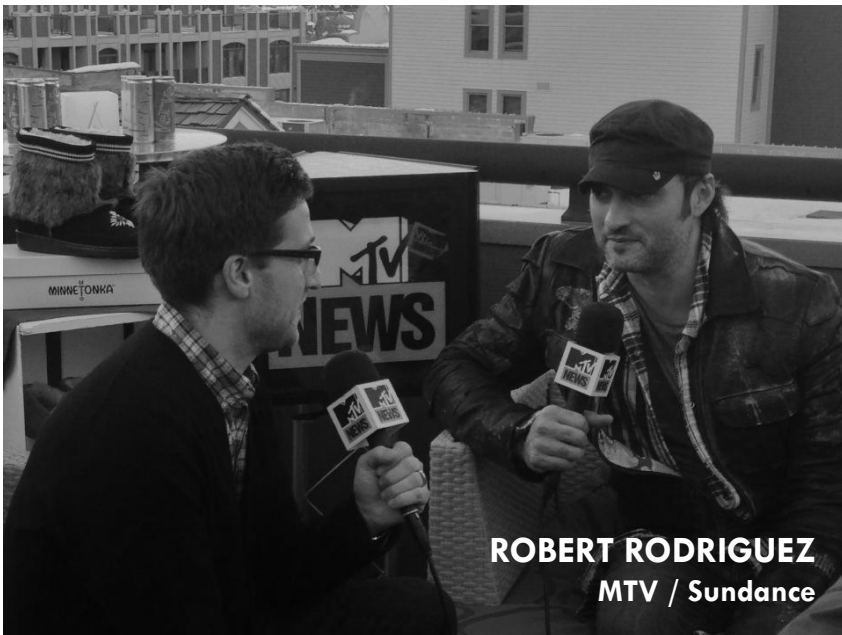
ROBERT RODRIGUEZ