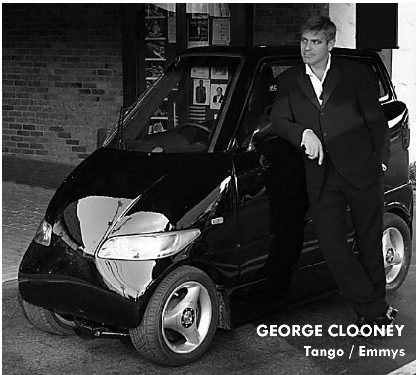
GEORGE CLOONEY Tango / Emmys